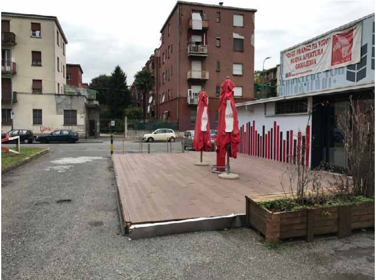
3. View of the raised platform just outside the covered market.

The project shall take into account connections between the New Library and public spaces/buildings, among others, the covered public market that spans outwards through a raised platform, (designed by the Gruppo di Lavoro G124 - Renzo Piano); this platform aims at attaining continuity between the inner commercial space and the outdoor space, thus enhancing the area towards the park.