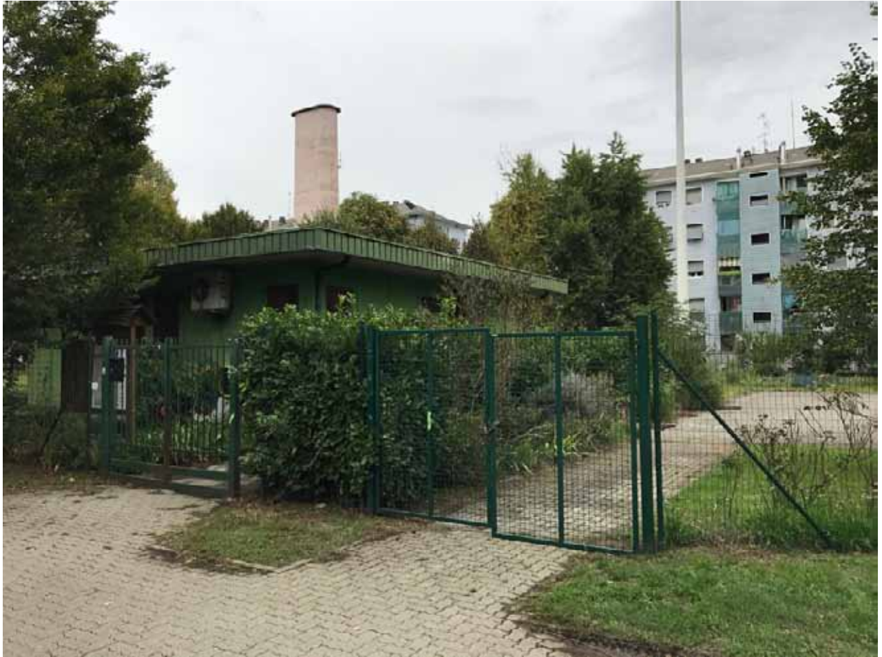
5. View of the “Casetta Verde” that will be knocked down once the New Library will be ready

Please note that the southern border of Perimeter 2 hosts a fountain/ amphitheatre made of stone and brick designed by architect Antonello Vincenti back in the '50s/'60s, whose architectural imprinting strongly marks the area and that shall be preserved.