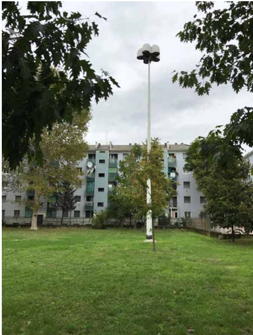
2. View of light-towers to be eliminated

Further indication on lighting: the entire lot has 5 functioning light-towers. The project is supposed to replace the two towers in Perimeter 1 and to replace them with an equally effective lighting system, however it shall be proportionate to a more “urban scale”; the three towers in Perimeter 2 shall be preserved and perhaps enhanced through luminaires placed on shorter light posts. Please refer to the document 3.4 - Plan of subservices .