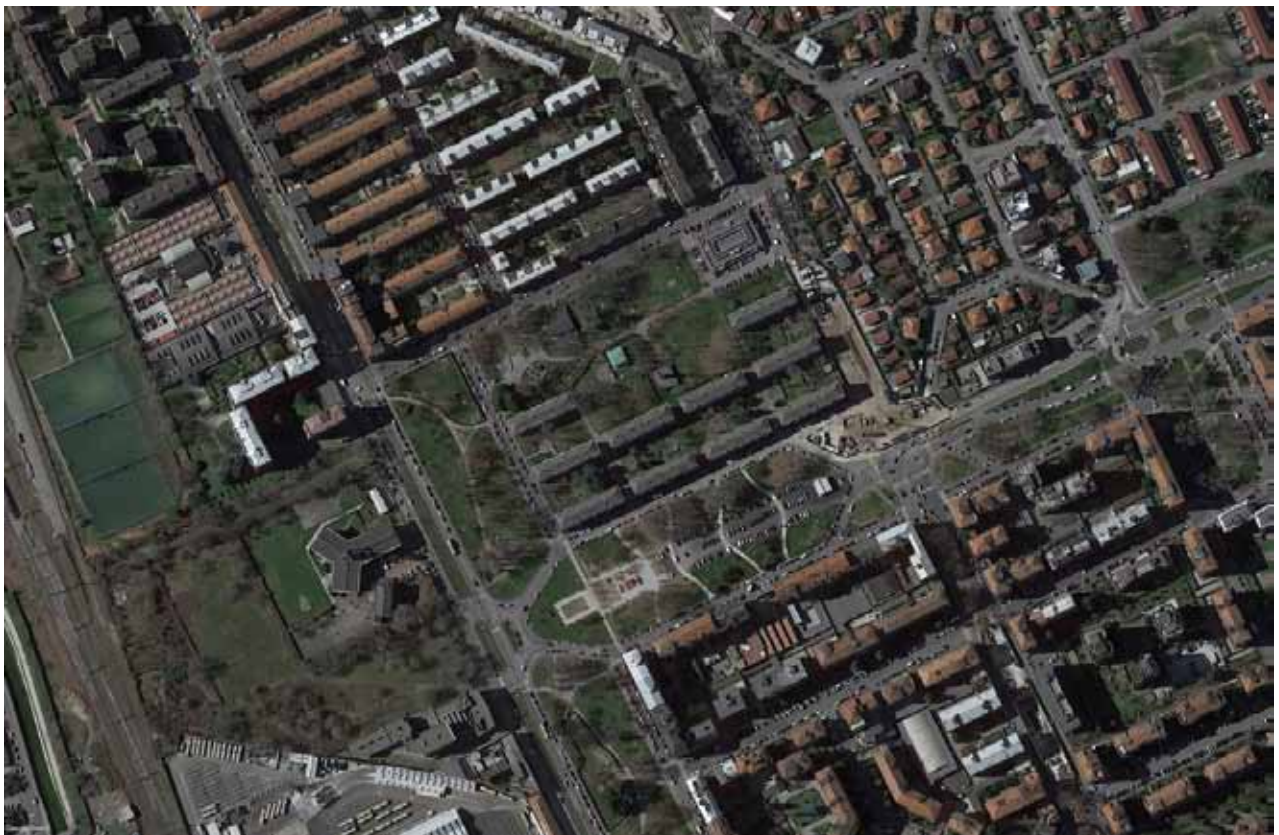
1. View over the area interested by the Competition

The detailed description and all information concerning the urban context where the new intervention will be implemented, shall be found in the Masterplan Programme for Urban and Sustainable Development, Lorenteggio district attached to present Competition. The Masterplan is an integral part of the Programme Agreement.