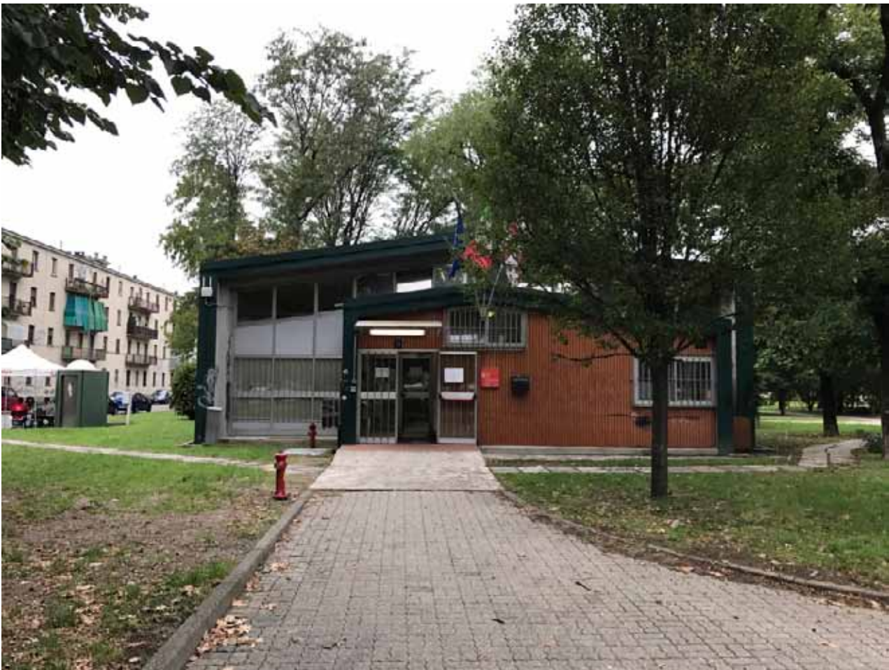
4. View of the front part of the Library - Lorenteggio District

The building, whose furniture has been substituted over time, preserves a similar setting to the original one. Currently, the library is under-sized if compared to the needs and it is not sufficient in terms of the functions and services it should provide.