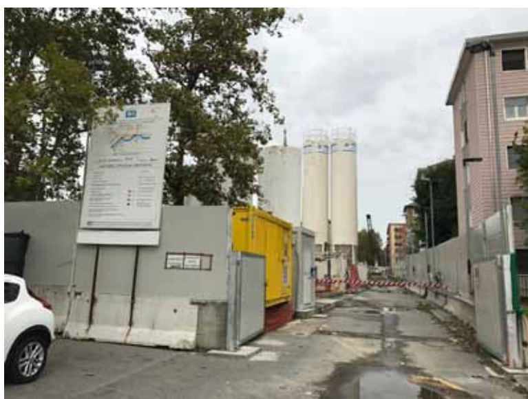
7. View of the working site of the future Station “Gelsomini” - Metro M4

For assessment on the accessibility of the lot, please note that the area includes working sites of Metro 4 for the implementation of the metro station “Gelsomini”, at the crossroad between Via Lorenteggio and Via Primaticcio. This station stands for an added value for the entire district, as well as a pivotal element to reach the New Library from the rest of the City,