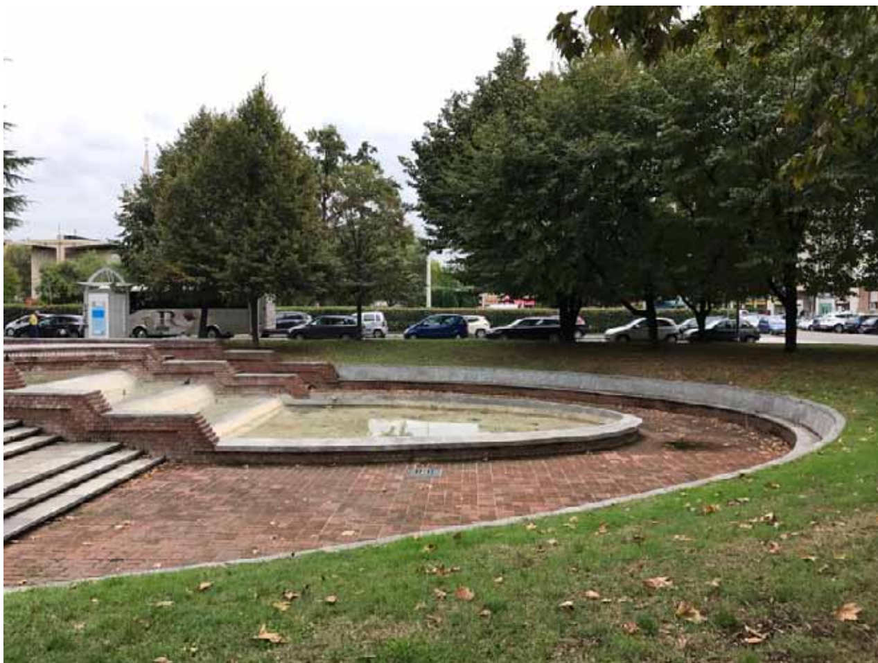
6. View of the fountain/amphitheatre

For assessment on the accessibility of the lot, please note that the area includes working sites of Metro 4 for the implementation of the metro station “Gelsomini”, at the crossroad between Via Lorenteggio and Via Primaticcio. This station stands for an added value for the entire district, as well as a pivotal element to reach the New Library from the rest of the City,